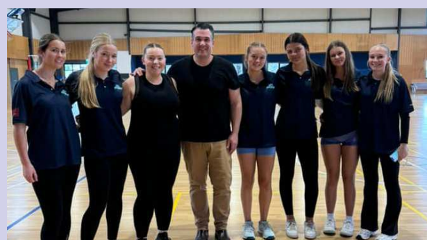
Park Orchards Netball Club

It was wonderful to join the Ringwood Little Athletics Centre for their recent trophy presentations.