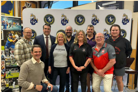
Cricket Season Launch

It was fantastic to join the BHRDCA for their season launch with some great local clubs in the Whitehorse area.