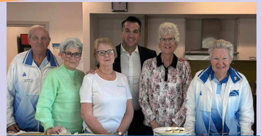
Vermont South Bowling Club

Despite the wet weather, it was fantastic to formally open the new season for the Ringwood Croquet Club , a local institution since 1931.