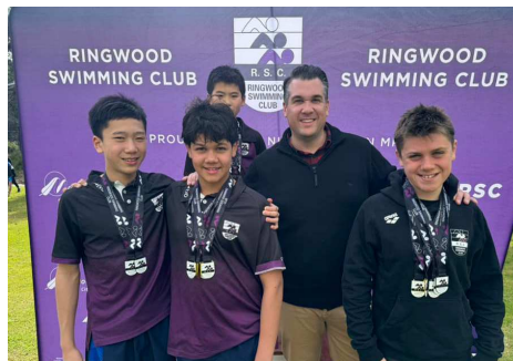
Ringwood Swimming Club

With local football finals wrapping up, I want to thank the hundreds of volunteers - the lifeblood of local football clubs - for the huge contribution they have made this year. Particular congratulations must go to the East Ringwood Football Club on another outstanding season, making the EFNL Premier Division Grand Final and just missing out on a Premiership by a couple of points.