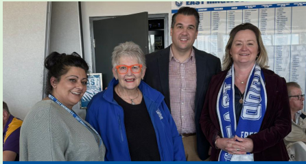
East Ringwood Football Club

I enjoyed catching up with some of the dedicated volunteers at the East Ringwood Football Club at one of their matches during the season.