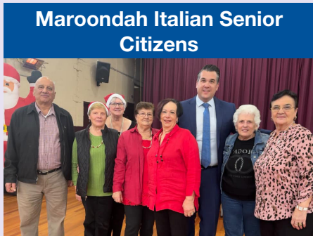
Maroondah Italian Senior Citizens

Congratulations to Hoskins Carpet Gallery in Blackburn on celebrating 70 years in business. This iconic local family business has served our community with distinction, so I was really pleased to join in the celebrations to mark the occasion.