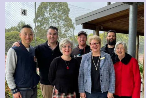
HE Parker Reserve Tennis Club

Thanks to everyone who stopped by for a chat at this year's Maroondah Festival .