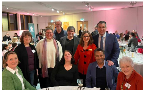
Whitehorse Community Dinner

I am always honoured to welcome our newest Australians at local citizenship ceremonies in Whitehorse and Maroondah.