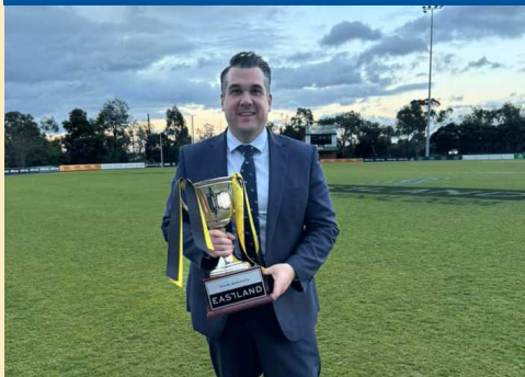
Mitcham Football Club

Having worked with the Mitcham Football Club for over a decade, I've loved watching their phenomenal success, culminating in this year's Division 1 EFNL Premiership.