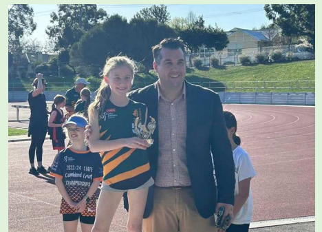
Ringwood Little Athletics

I dropped in and caught up with the South Warrandyte Hawks Cricket Club , who I'm proud to now be supporting as a sponsor. I'm very pleased to have South Warrandyte joining the Deakin electorate under the recent electoral boundary changes.