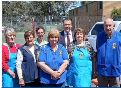
U3A Croydon Community Open Day

It was wonderful to visit the 2024 Whitehorse Seniors Festival at the Nunawading Community Hub . A big thank you to the dedicated volunteers from U3A Nunawading and Rotary Club of Nunawading for their wonderful efforts.