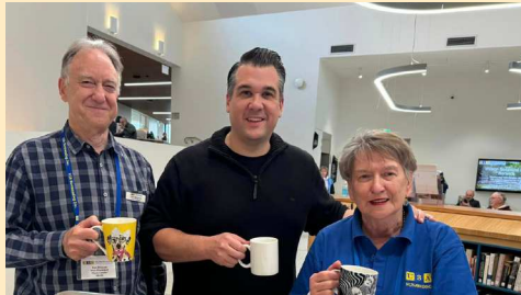
Whitehorse Seniors Festival

It was wonderful to visit the 2024 Whitehorse Seniors Festival at the Nunawading Community Hub . A big thank you to the dedicated volunteers from U3A Nunawading and Rotary Club of Nunawading for their wonderful efforts.