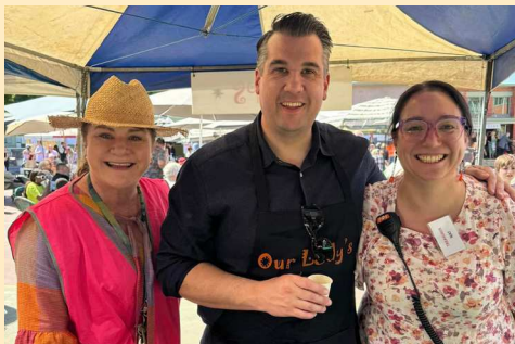
Our Lady's Community Fete

Thanks to all the volunteers from the Holy Spirit School and Parish community in Ringwood North for putting on another huge fete again this year.