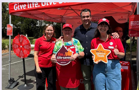
Red Cross Lifeblood

I was pleased to visit the 3rd Croydon Scout Group for the Maroondah District Annual Reports and Presentations. Congratulations to all the award recipients and volunteers.