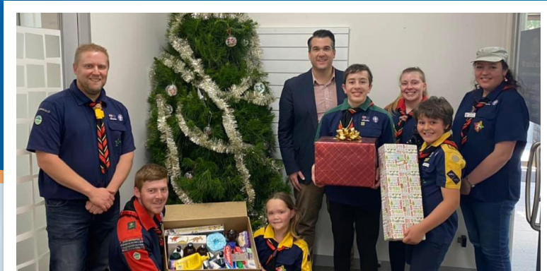
Christmas Giving Tree

I am again asking local residents, community groups and businesses to support the Deakin Christmas Giving Tree by donating non-perishable food items including Christmas puddings and cakes, along with vouchers, children's toys and other essentials such as new clothing, blankets and toiletries. This year the Deakin Christmas Giving Tree will provide much-needed support to local families through Hope City Mission , Croydon. Donations can be dropped off at my office in Mitcham or the Bendigo Bank branches in Ringwood East or Croydon until Friday, 20 December 2024.