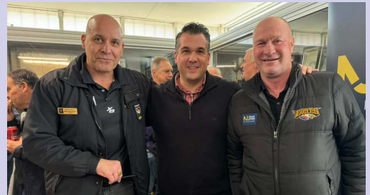
Vermont and Norwood Football Clubs

It was great to be with the two presidents of Vermont Football Club and Norwood Football Club at a match late in the season.