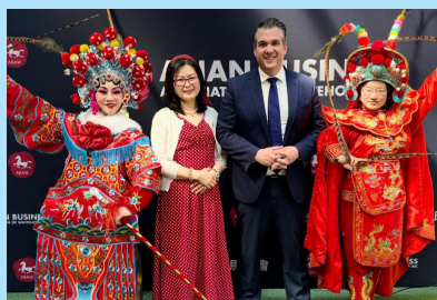
Lunar New Year Festival Launch

The weather was perfect for this year's Our Lady's Community Fete in Ringwood. As always, I enjoyed my stint on the chip stall.