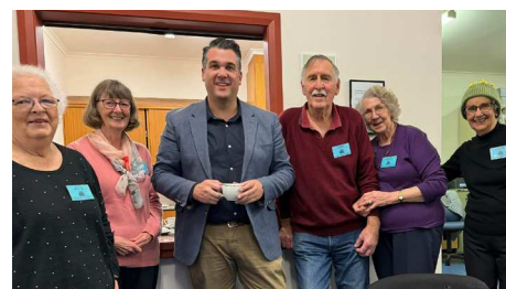
Whitehorse Historical Society

It was great to meet with the team at Osteopathy Australia in Blackburn and hear first-hand about the industry and the current challenges osteopaths face.