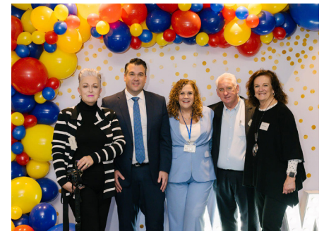
Women of Whitehorse

Thanks to the Whitehorse City Council for hosting the 2024 Whitehorse Community Dinner. It was wonderful to catch up with so many hard-working volunteers who make such a contribution to our community.