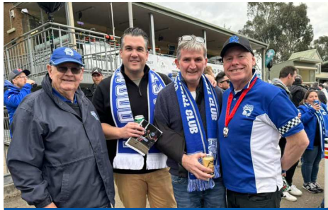
Local Football Finals

Having worked with the Mitcham Football Club for over a decade, I've loved watching their phenomenal success, culminating in this year's Division 1 EFNL Premiership.