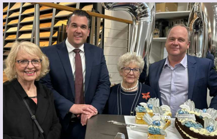
Hoskins Carpet Gallery

I recently joined manufacturers from across the country at local business Innomerix , a leading speciality plastics company based right here in Nunawading, for a demonstration of their industrial 3D printers.