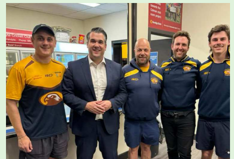
South Warrandyte Cricket Club

It was fantastic to visit the team at the Ringwood Swimming Club for their recent short course meet at Aquanation .