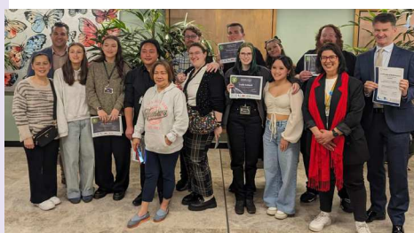
Glen Park Community Centre

Lifeblood Donor Centres, including in Ringwood, will be open throughout the holidays, including many on Christmas Day and New Year's Day. I encourage anyone who is healthy to book an appointment on 13 45 95 or visit lifeblood.com.au .