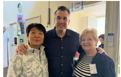
Holy Name Vermont South Fete

I joined the Asian Business Association of Whitehorse for the launch of the 2025 Lunar New Year festival, which promises to be bigger and better than previous years.