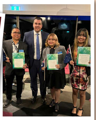
Our Newest Australian Citizens

I am always honoured to welcome our newest Australians at local citizenship ceremonies in Whitehorse and Maroondah.