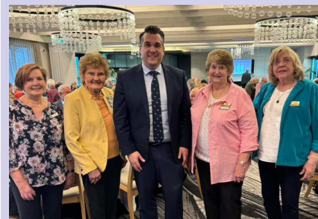
Croydon Park Probus Club

Congratulations to all the graduates from the Glen Park Community Centre Hungry 4 Success retail training course.