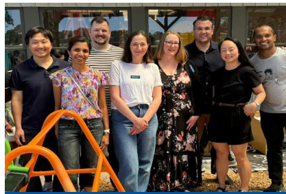
Birralee Preschool Vermont South

It was wonderful to join the Maroondah Italian Senior Citizens Club at one of their recent gatherings.