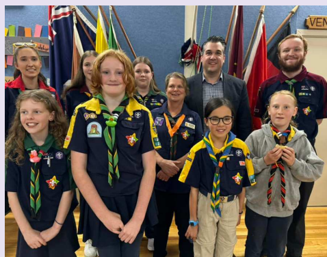
Maroondah District Scouts

I was pleased to visit the 3rd Croydon Scout Group for the Maroondah District Annual Reports and Presentations. Congratulations to all the award recipients and volunteers.