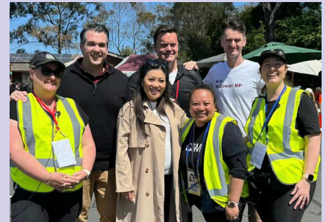
Holy Spirit Community Fete

It was great to drop into the U3A Croydon community open day.