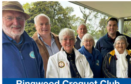
Ringwood Croquet Club

I enjoyed catching up with some of the dedicated volunteers at the East Ringwood Football Club at one of their matches during the season.