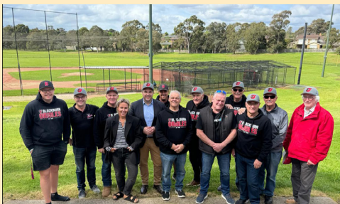
Blackburn Baseball Club

It was fantastic to join the BHRDCA for their season launch with some great local clubs in the Whitehorse area.